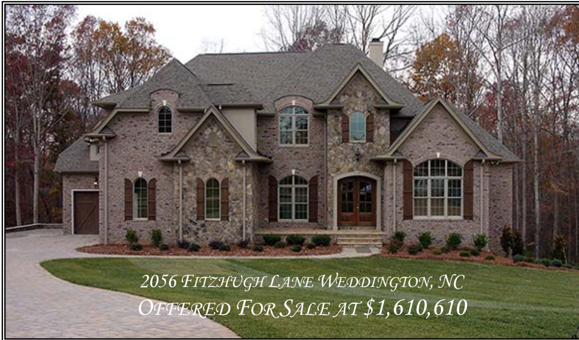
2056 FITZHUGH LANE WEDDINGTON, NC OFFERED FOR SALE AT $1,610,610

This home is more unique than you probably realize. One of the great features of a finished basement is the ability to design it to specifically your own desires. In this home, we have included a finished basement complete with 2 full bathrooms, but we are waiting on your instruction as to how you want it designed and finished before the final construction begins. Once the design is complete, we should be able to finish the space in 60 days or so. The way we have built the house, you can even move in while we finish the basement with absolutely minimal disruption. This is a truly unique, one of a kind opportunity to have a finished house with your own signature.